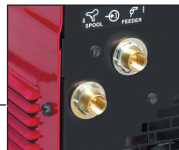
Additional Gas Solenoid – Controls Gas Flow to a Spool Gun