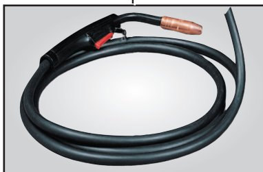
Extra-Length 15 ft. (4.5 m) Gun

Adds 4-step trigger interlock, spot mode, adjustable run-in speed for smoother arc starting, and adjustable burnback time to minimize wire sticking in puddle.