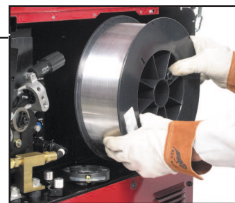
Easy Load Wire Compartment