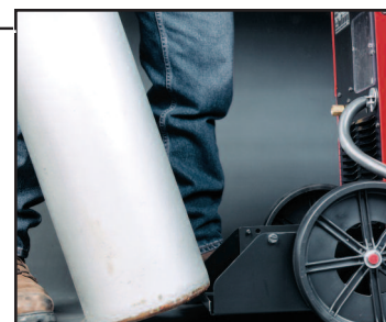
Easy Load Gas Cylinder Platform