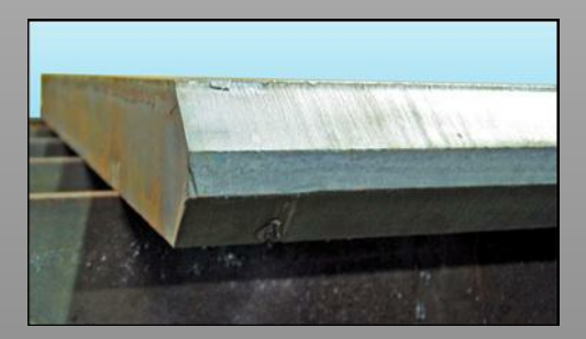
Detail Double V-Groove

Performs straight line, hand guided and circle cutting.